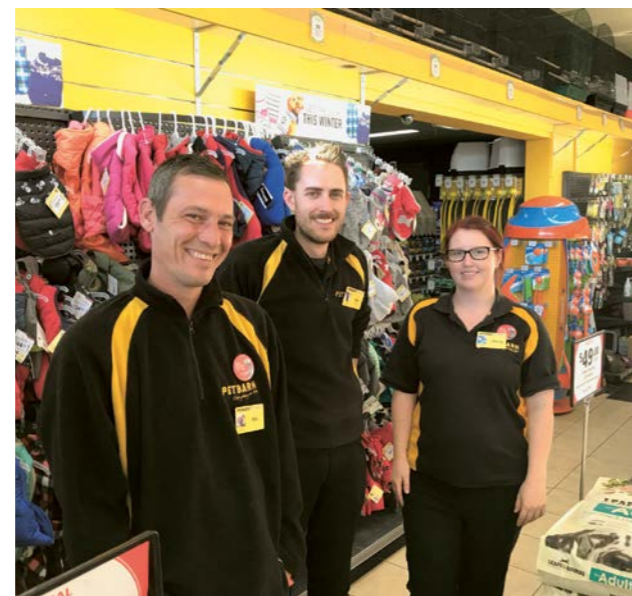
Petbarn staff in Belconnen store, ACT

We're so grateful to Petbarn and their customers who raised such an incredible amount, potentially giving 13 Australians who are blind or have low vision an opportunity to receive a life-changing companion.