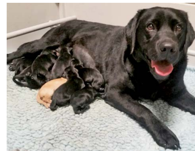
Skyla and her adorable pups!

Will you help a puppy like Peggy today? Please call 1800 42 20 07, complete the coupon attached or visit our website seda.visionaustralia.org/sponsor . Thank you!