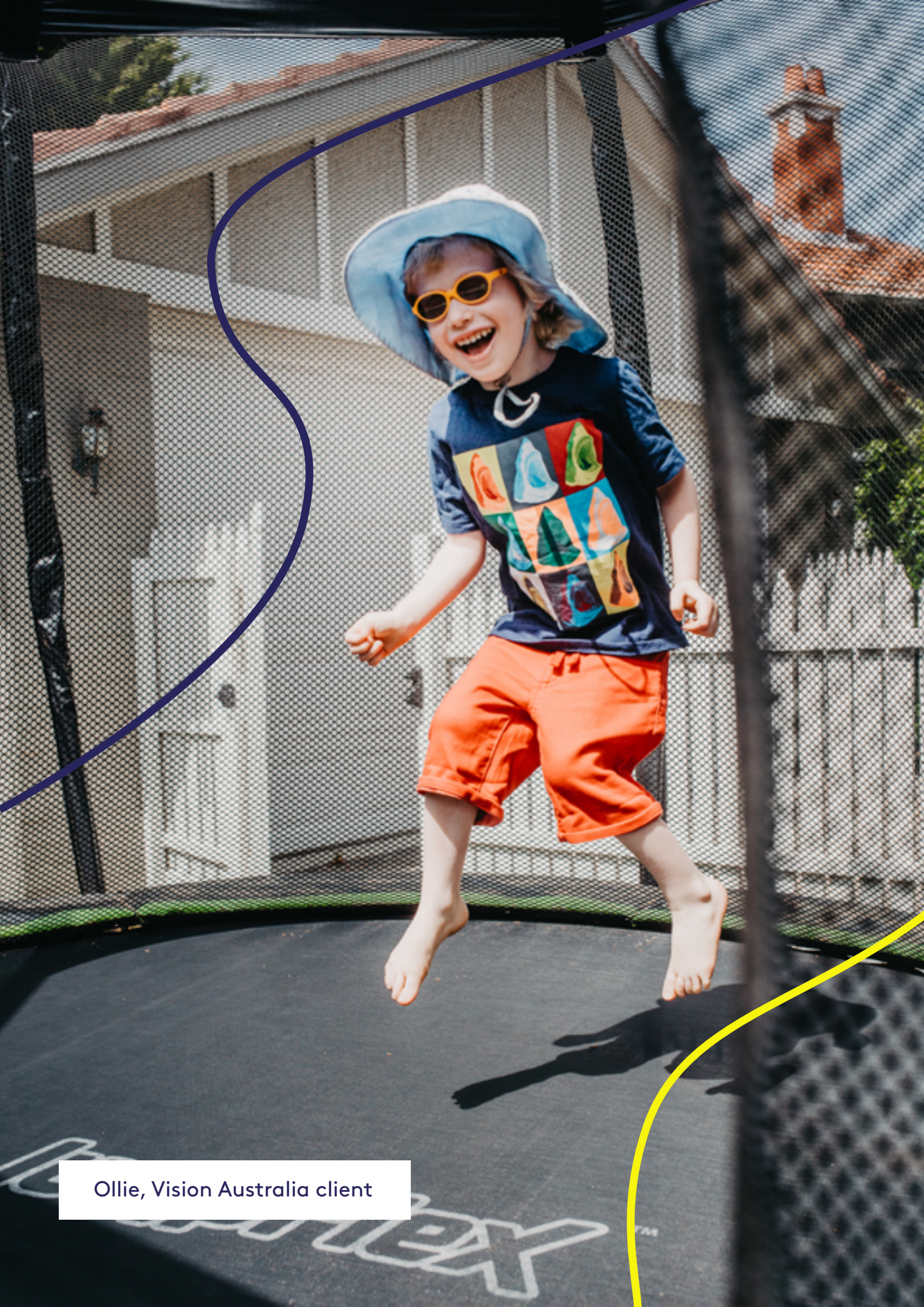
Ollie, Vision Australia client