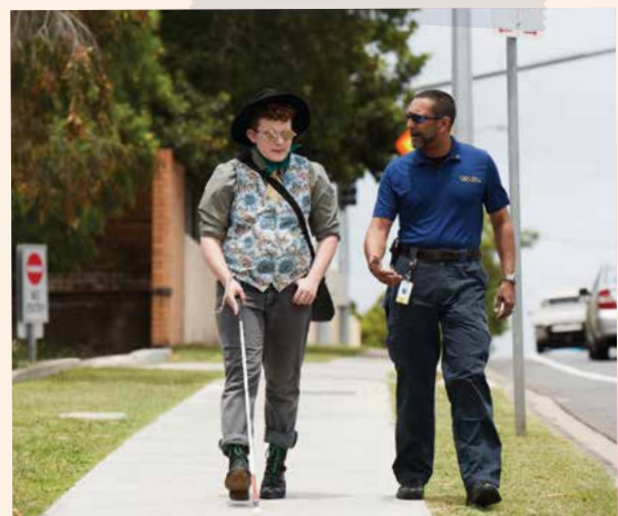
Uneven surfaces on the pathway can be accidents waiting to happen. Vision Australia specialist shows how to use the long white cane to watch out for these dangers.