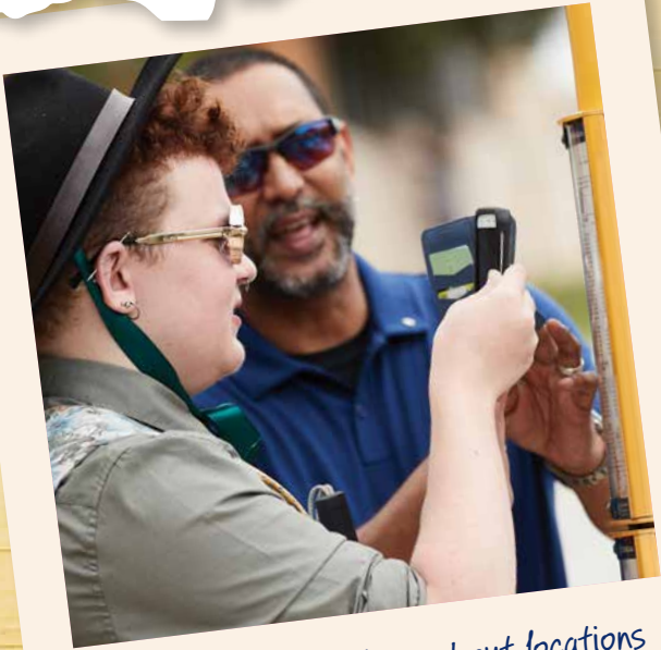
Assistive devices help read out locations and maps enabling travel to new places with more independence.

Vision Australia's Orientation and Mobility specialists work with people who are blind or have low vision to learn how to use their cane and navigate safely and with greater independence.