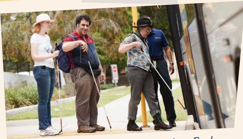
Getting in and out of a bus is not easy as it looks. People using a long white cane must learn how to avoid dangers and be able to get in and out of a bus safely.

Imagine how terrifying the world can be when you can't see the dangers ahead of you. This is why your gift is so life changing. Your support helps provide critical mobility training to help people learn to travel to new places independently. Because of you, people living with blindness or low vision can enjoy a better quality of life doing all the things they set their minds to.