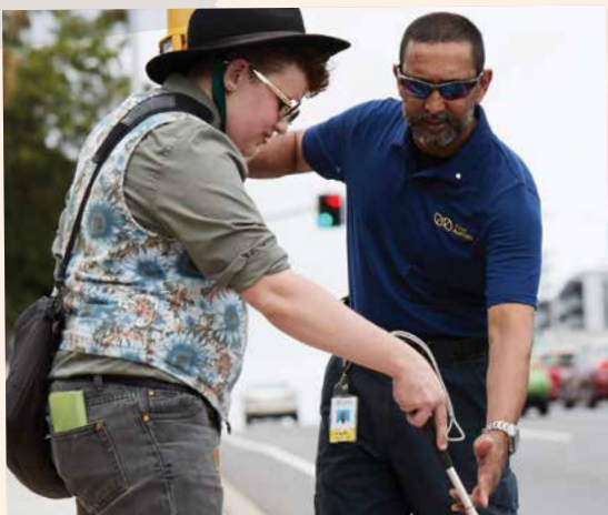
Getting the hold right: users need to learn to keep the cane centred, in front of the body.