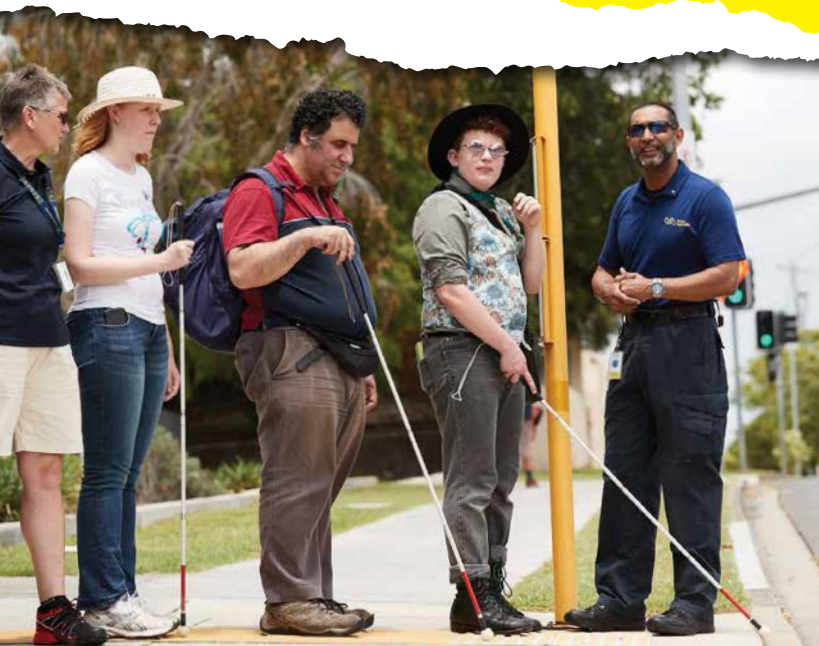
Waiting for the bus. It's hard to tell which one is the right bus or if it has pulled up right in front of you. This can be a daunting task for someone who has no sight.

Imagine how terrifying the world can be when you can't see the dangers ahead of you. This is why your gift is so life changing. Your support helps provide critical mobility training to help people learn to travel to new places independently. Because of you, people living with blindness or low vision can enjoy a better quality of life doing all the things they set their minds to.